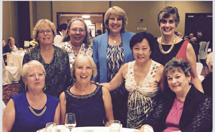
The annual event provides an opportunity for all classes to enjoy time together and share memories.

SAVE THE DATE for this year's event scheduled for Friday, September 23, 2016 at the Normanside Country Club, Albany.