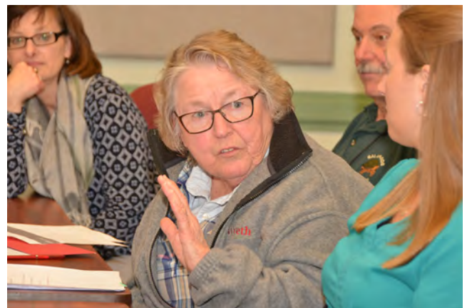
Advisory Council members.

Leaders at the Acute Care Troy Division launched the "Patient and Family Advisory Council" at its two Troy hospitals, bringing together a group of patients, family members, staff liaisons, and hospital leadership for thoughtful discussions and valuable feedback on the customer care experience. Observations and suggestions from the group are incorporated into hospital operations to help improve care for patients at the hospitals and their families.