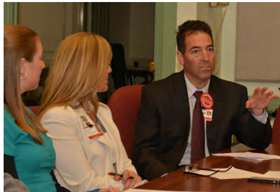
Advisory Council members.