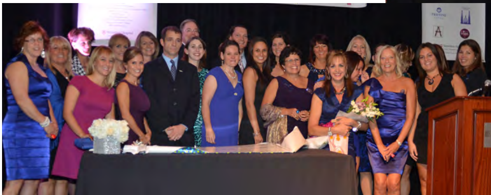
Visions of Strength planning committee